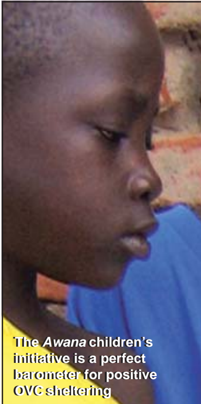
The Awana children's initiative is a perfect barometer for positive OVC sheltering

C ULTURE AND TRADITION, so is religious beliefs, are an inherent feature that helps identify a people and give them recognition - setting them apart from differing groups and areas.